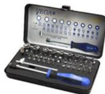
V39 39 PC INDUSTRIAL BIT, SOCKET & HAND DRIVER BIT SET