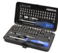
VSH53A 53 PC INDUSTRIAL BIT & HAND DRIVER SET