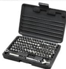
VHS100A 100 PC MASTER DRIVER BIT SET

Vega Y-Adapter is also included in the following sets: VHS100A , V39 , VSH53A