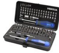
VSH53A 53 PC INDUSTRIAL BIT & HAND DRIVER SET