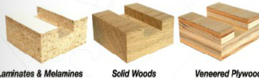
Laminates & Melamines

Cuts Clean Flat-Bottom Grooves in Materials such as: