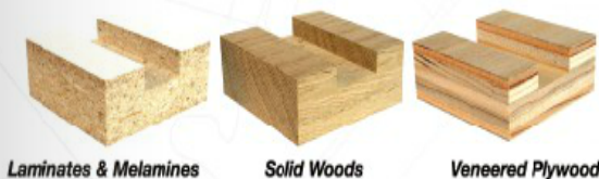
Laminates & Melamines