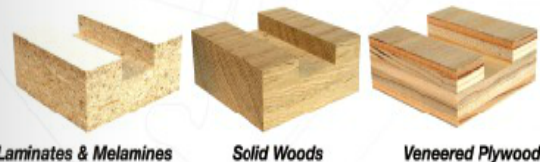
Laminates & Melamines