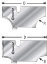
Body Type A (Edge Form Routing) Profiles

Thank you for shopping with us! The Nova System™ provides a wide range of profiling options in a single router bit with replaceable insert solid carbide knives. The innovation is in the bit. The easily replaceable hard carbide blades give an entire range of profile options in a single bit, as well as other vital advantages such as durability, versatility, safety, service-free, and cost effectiveness. For edge form routing. Ordering instructions: Choose the edge form body type 'A' #NS-104 (1/4" shank) or #NS-106 (1/2" shank), and then select the desired profile knives (NRC-A03 through NRC-A23). Body type 'A' includes both concave and convex knife retainers and ball bearing guide. Knives are marked to indicate which retainer is needed.