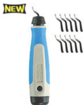
Carbide Deburring Sets 2 types available