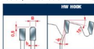
Tooth features - Caratteristiche del dente

Ideal For: To size bilaminated panels without the employment of the scoring sawblade up to 40mm thick. In detail, it is suitable to work melamine-coated panels.