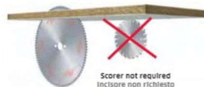
Working with spindle over the working plane Lavorazione con albero sopra il piano di lavoro