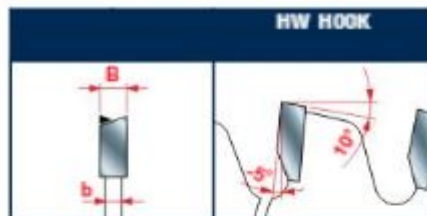
Tooth features - Caratteristiche del dente