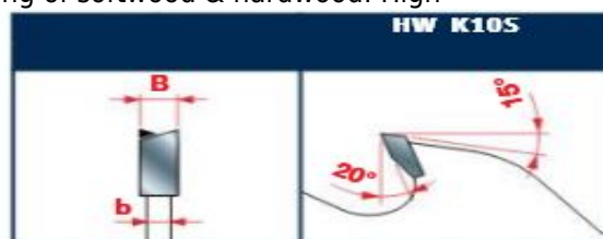
Tooth features - Caratteristiche del dente