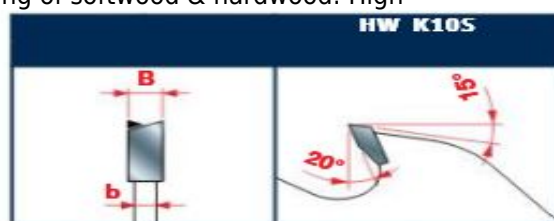
Tooth features - Caratteristiche del dente