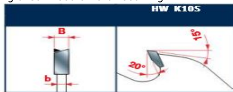
Tooth features - Caratteristiche del dente