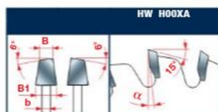
Tooth features - Caratteristiche del dente

Ideal For: Scoring sawblades for cutting coated panels on sizing machines.