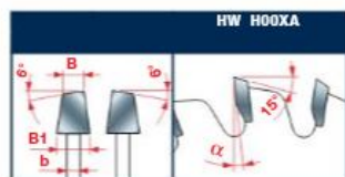
Tooth features - Caratteristiche del dente

Ideal For: Scoring sawblades for cutting coated panels on sizing machines.