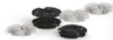
Our multi-profile head will accept any of these 14 profiles