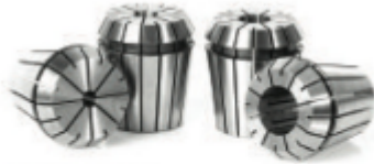
Tool No. CO-ER40 Includes 4 collets: CO-246, CO-248, CO-250, CO-254

124 South Collins Arlington, TX 76010 Phone: 817-461-7171 • Fax: 817-795-6651 Toll Free: 888-461-7171 Email: info@eoasaw.com Website: www.eoasaw.com