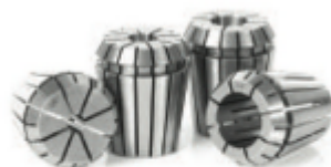
Tool No. CO-ER32