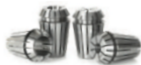
Tool No. CO-ER20