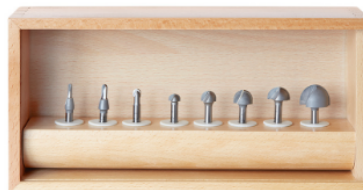
Wood Storage Box

Stored in a solid wood showcase storage box with a Plexiglas® clear lid.