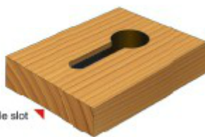
Example of Key Hole slot