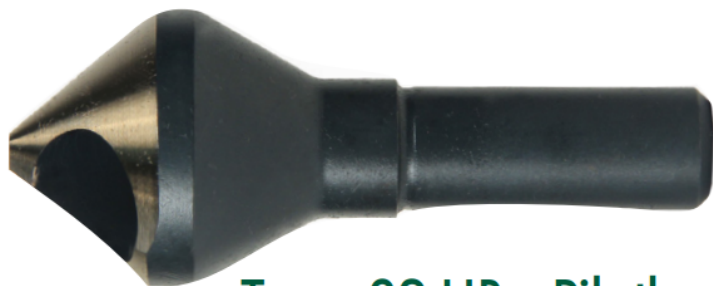
Type 82-UB - Pilotless