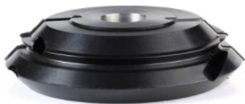
Item #61290, Amana Tool Insert Carbide 45 Degree Lock Miter 170mm (6-11/16) Dia x 40mm (1-1/2) x 1-1/4 Bore $428.85

124 South Collins Arlington, TX 76010 Phone: 817-461-7171 • Fax: 817-795-6651 Toll Free: 888-461-7171 Email: info@eoasaw.com Website: www.eoasaw.com