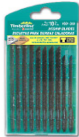
Complete 10 Piece Set T-Shank Jigsaw Set - 601-360

Timberline® T-Shank Jigsaw blades easily cut material quickly, smoothly, and precisely in today's conventional and specialized materials.