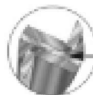
Center Carbide Tip