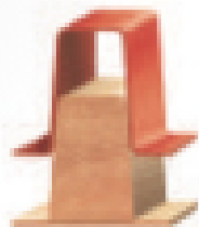
Vacuum-forming mold (wooden)