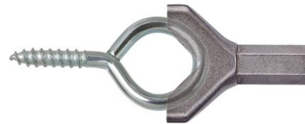
Placement of the screw eye into the Y-Adapter groove

Vega Y-Adapter is also included in the following sets: VHS100A , V39 , VSH53A