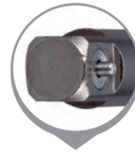
Pin lock provides extra security and safety