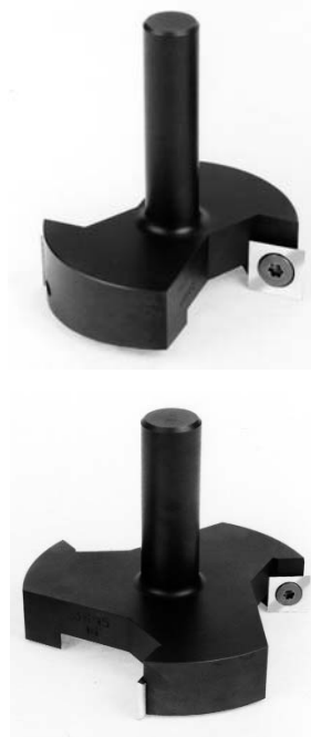
Figure 2. These spoilboard surfacing cutters are used for surfacing MDF, particleboard and balsa core where “flow through” or “high flow” cutting is employed using large capacity vacuum pumps.

Since the universal vacuum approach involves high flow without the inherent benefits of dedicated spoilboards, the op-